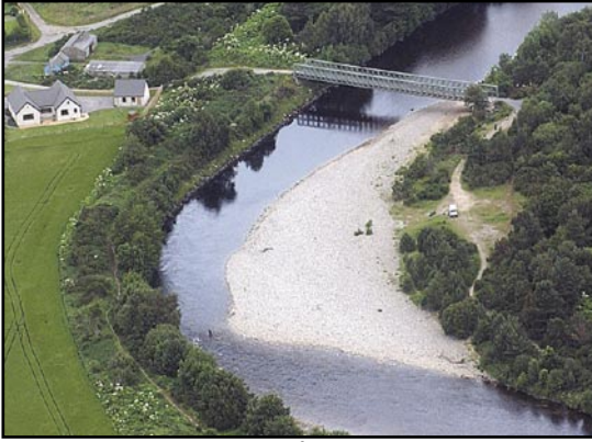
River Findhorn at Broom of Moy