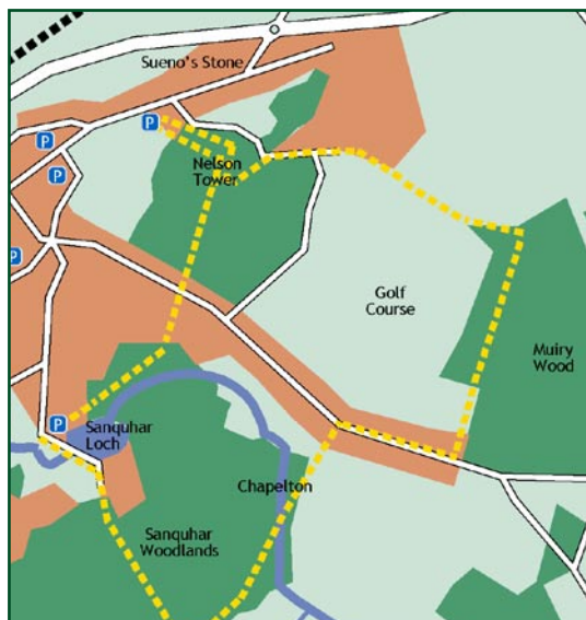
This leaflet uses map data licensed from Ordnance Survey® with the permission of the Controller of Her Majesty's Stationery Office. ©Crown Copyright. Licence No 100042833

Cross the public road and move along the track